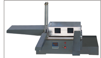
sample feeding and positioning device (included)