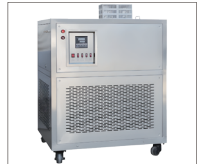
low-temperature chamber (optional)